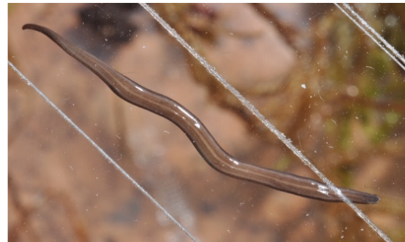
Dorsal and ventral surfaces of a single specimen showing the stripes. Lines are 1 cm apart.