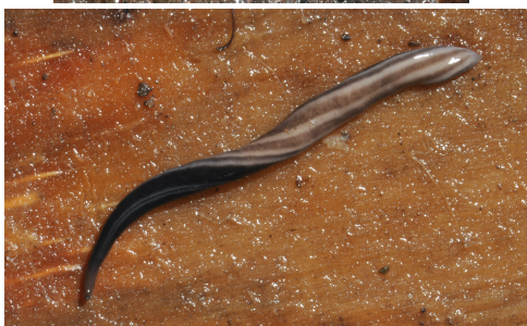
Parakontikia ventrolineata . Upper: several specimens about 2 cm long. Centre: two specimens ca 4 cm long, with a woodlouse carcass. Lower: a twisted specimen showing the underside.